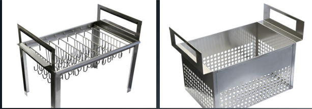
OPTIONAL: Gancettiera e cestello. / Basket and hooks. Haken und Korb. / Porte-crochets et panier.

ITALIANO | ENGLISH | DEUTSCH | FRANÇAISE